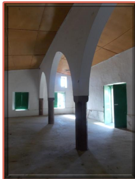
Inside the mosque