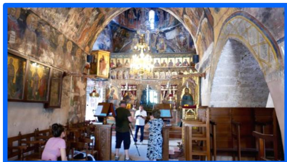
Christos on location