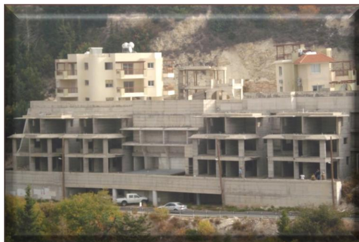
What it used to look like III