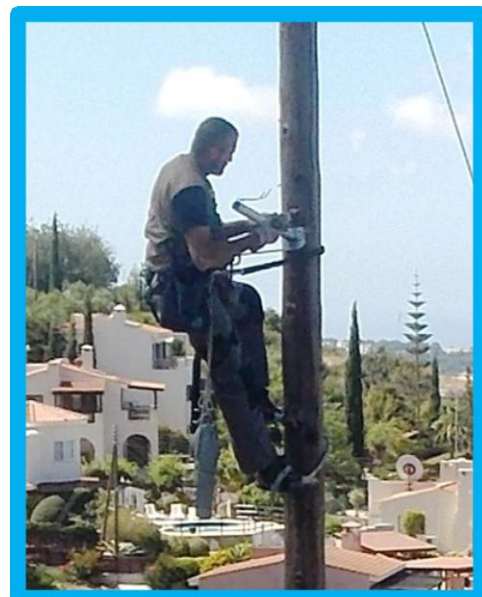
I don't fancy his job!!!