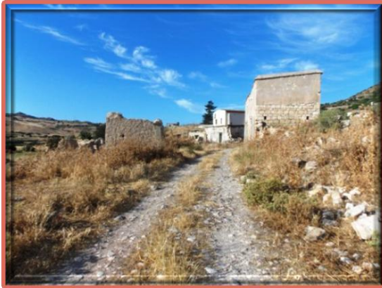
Mosque in the distance