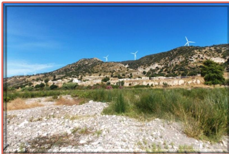
Souskiou in the distance under the windfarm

You have probably driven past here a number of times on the F616 road after the airport driving up to the Troodos. It is an abandoned village with a mosque and church and located 4 kms north of Kouklia. The origin of the name is obscure. Since the Ottoman period, the Turkish Cypriots of the village used the name Susuz which means without water. The village is now empty apart from one building full of hay, and in ruins. Check out more information, photos and video https://cypriot-villages.uk/abandoned-village-souskiou/